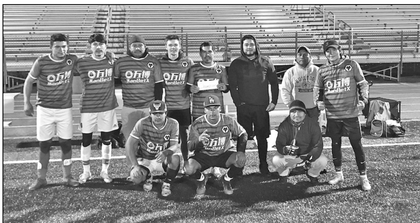
Team SANTOS took home the November title at the UCHS soccer program's monthly fundraiser tournament.